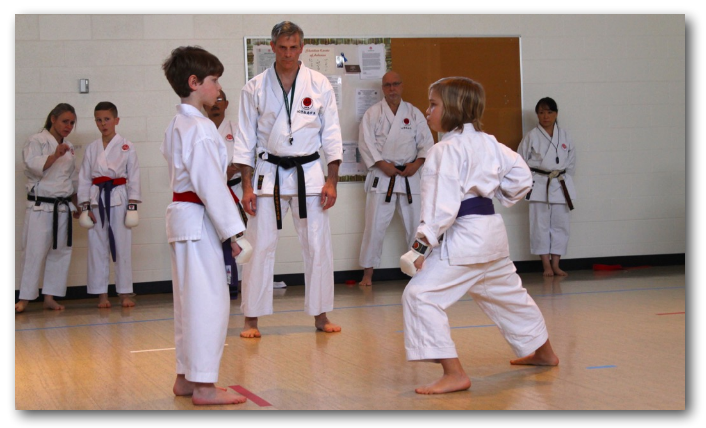
Two Youth students compete in basic sparring competition at the Anderson Youth Shiai

Anderson Karate in Cincinnati has been conducting a youth shiai or "contest," since 2012. The Anderson shiai started as a practice tournament for the local youth students as a way to begin preparing for the ISKF National Tournament being held in Cincinnati in the fall of 2013. The shiai also gave table workers, and judges practice for their roles in Nationals as well. After the