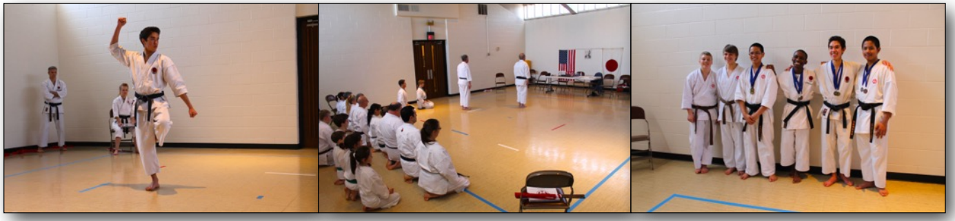
Scenes from the Anderson Youth shiai in February 2016