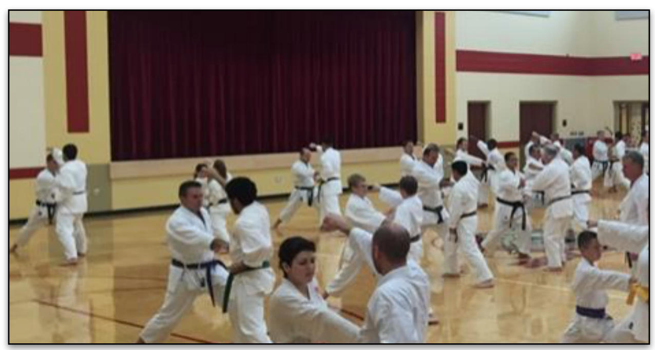
Students training at our annual March regional clinic in West Milton, OH